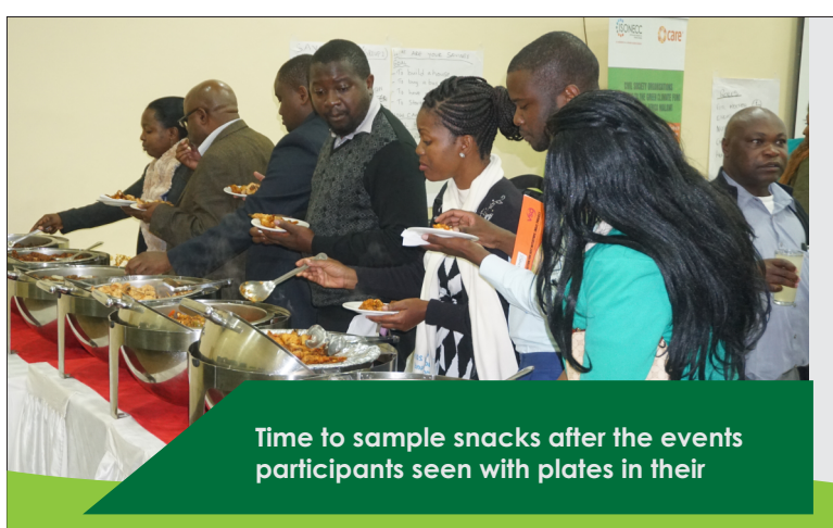
Time to sample snacks after the events participants seen with plates in their

The side event targeted GCF readiness project partners, country representatives and interested stakeholders participating in the CBA 12.