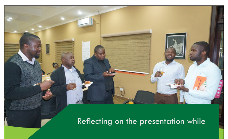
Reflecting on the presentation while