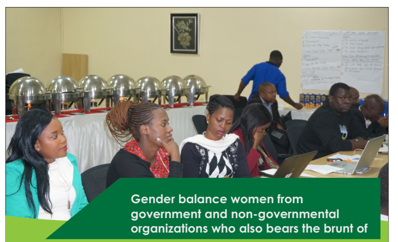
Gender balance women from government and non-governmental organizations who also bears the brunt of